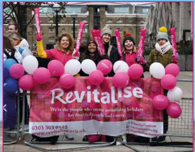
Team Revitalise ready to cheer on our fantastic runners