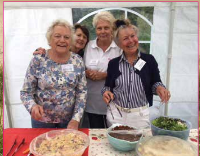
Our Friends of Jubilee Lodge group hosting one of their brilliant fundraising events